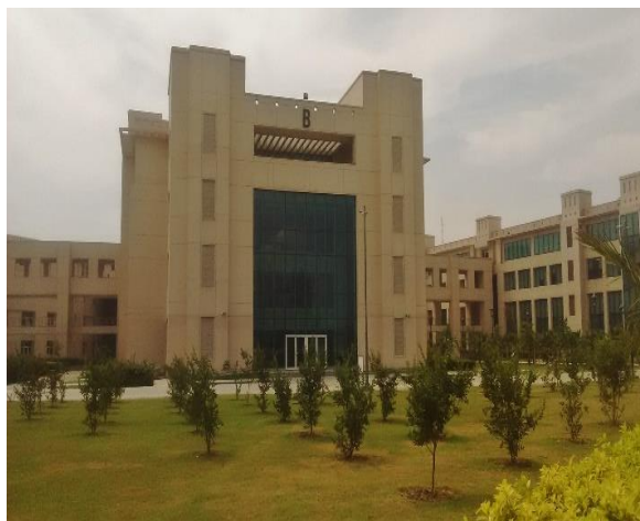
The Department of Mathematics is housed in the School of Natural Sciences.